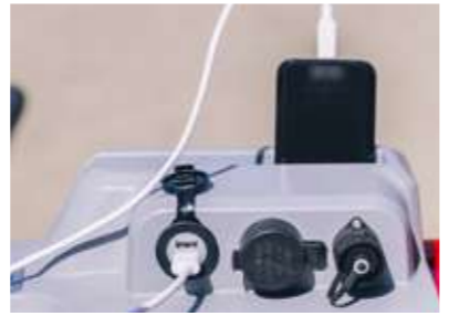
PHONE SUPPORT with 2 USB ports and 12 V socket