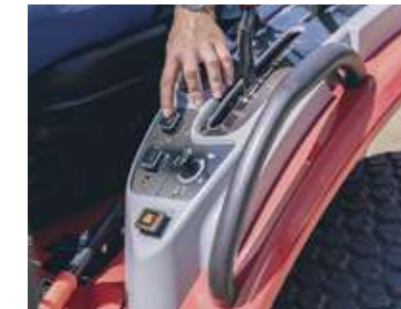
Easy operation with the Cruise Control

The MF 1525 uses a double pedal control with one for each driving direction, allowing clutch-less driving for more comfort.