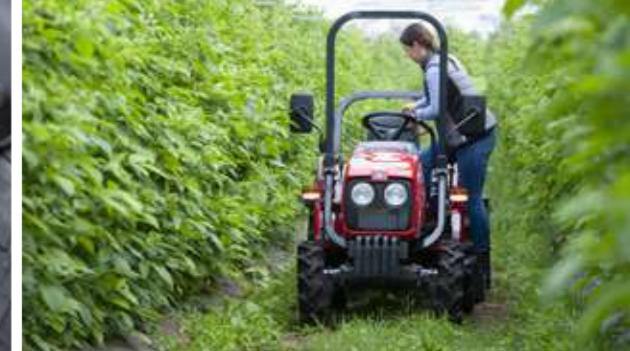
EASY ACCESS from both sides with foldable rear ROPS

Features may differ depending on model. Ask your MF Dealer for more details.