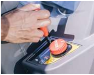
Well positioned hand throttle lever socket