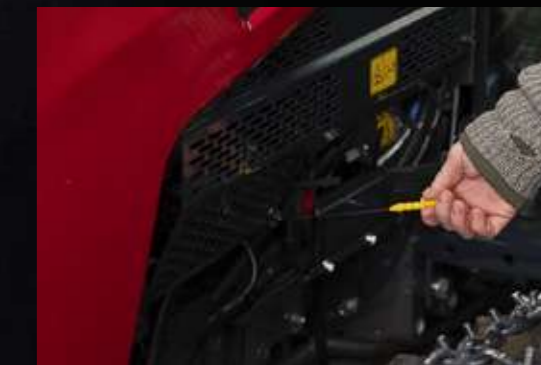
Simple and quick access for routine maintenance.