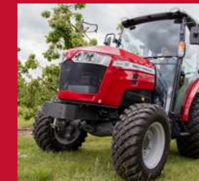
MIXED SERVICES TYRES