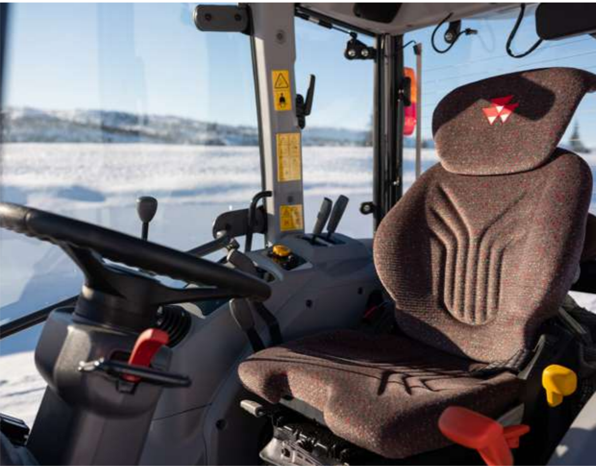
COMFORTABLE WORKPLACE FOR AN EASIER DAY Optional air suspended seat available