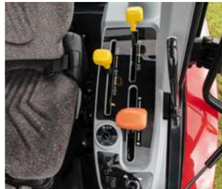
Colour coded levers make operations fast and easy