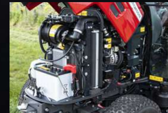
The waisted bonnet and front axle design ensures comfortable access to the engine.