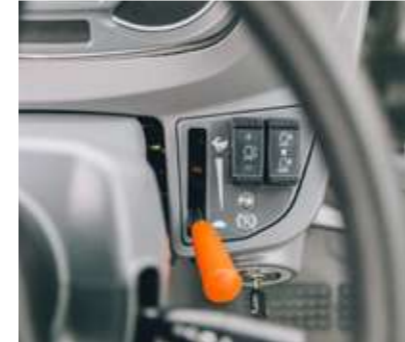
Handy controls to set and activate the engine speed