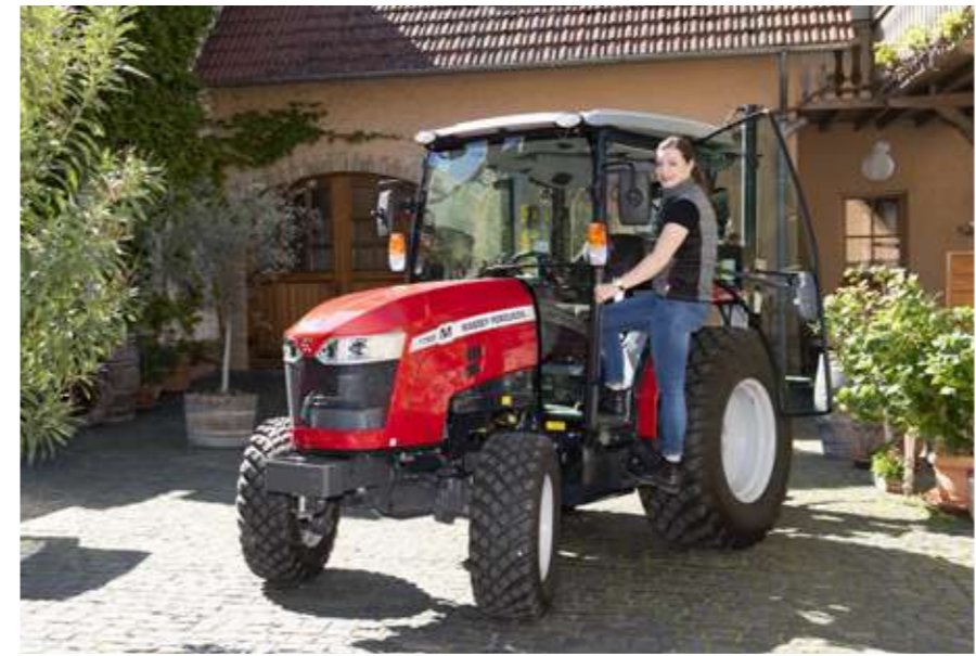
Easy and safe access with hand grips and a footstep