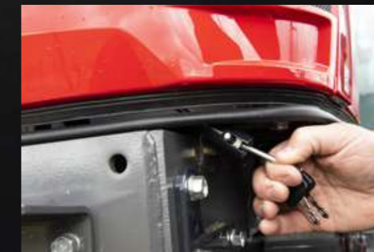
Easy bonnet opening.

Everything we offer has been scrutinised by our engineers from all perspectives – optimum compatibility with your machine, safety, durability and performance. You'll get expert service from your Massey Ferguson dealer who has all the necessary installation tools and knowledge at their fingertips.