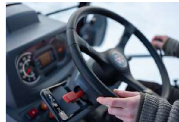
Mechanical transmission with Power Shuttle on the MF 1700 M-12Fx12R speeds for maximum comfort for each application.