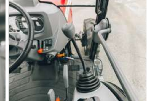
More comfort with the tiltable steering column and the right hand-side hydraulic joystick for easy and accurate implement control