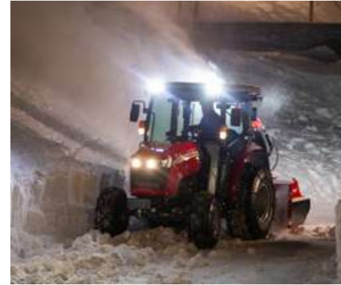
4 LED WORKING LIGHTS – two front and two rear

SOMETIMES IT'S THE SMALL DETAILS THAT CAN MAKE A HUGE CHANGE TO YOUR WORKLOAD.