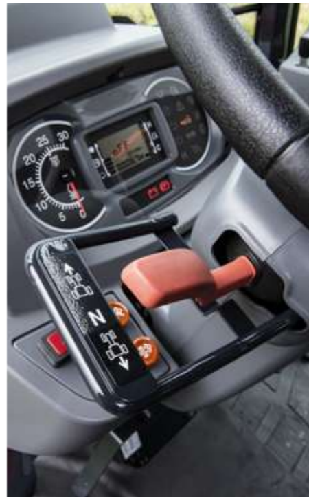
Electro-hydraulic shuttle lever on MF 1700 M models to improve comfort