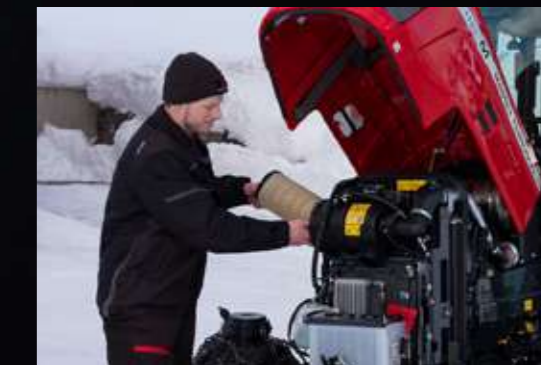
The well proportioned cooling package is easy to access, clean and maintain. The engine air filter is also very easy to access and clean.